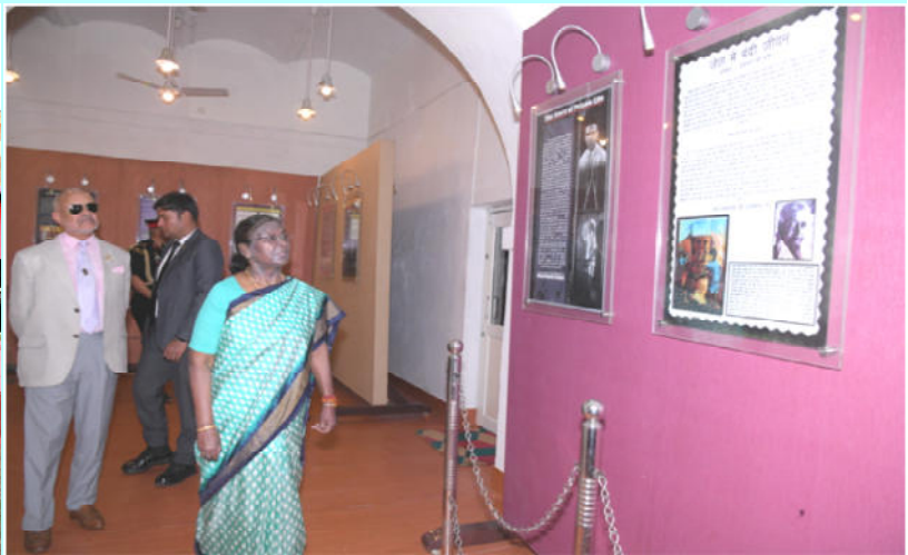
Hon'ble President, Smt. Droupadi Murmu at the historic National Memorial Cellular Jail.