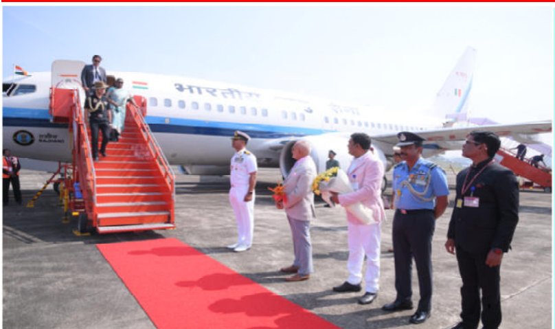
Hon'ble President, Smt. Droupadi Murmu being welcomed by Hon'ble Lt. Governor of A&N Islands, Admiral DK Joshi, PVSM, AVSM, YSM, NM, VSM (Retd.) and other dignitaries, on her arrival at Port Blair on February 19.