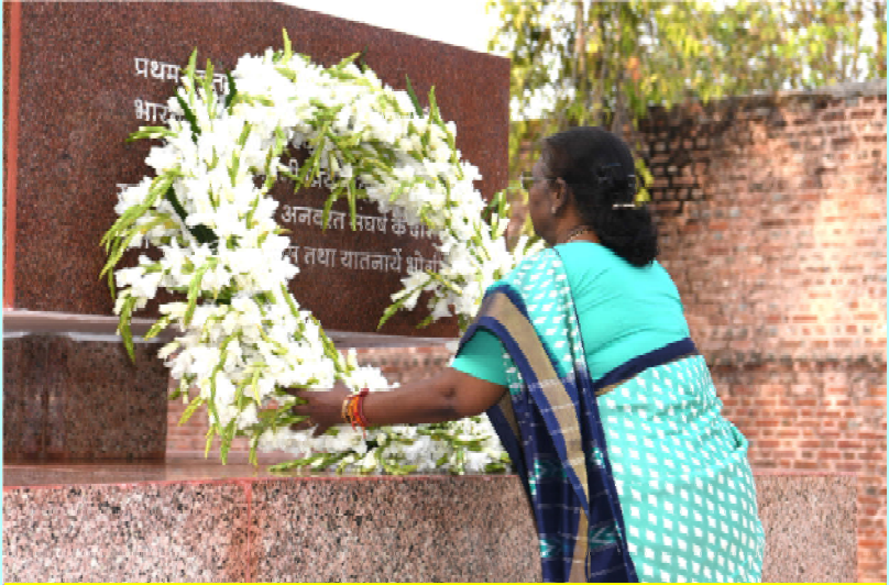
Hon'ble President, Smt. Droupadi Murmu laying wreath at the Martyrs' Column at National Memorial Cellular Jail on February 19.