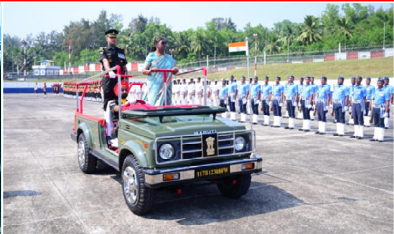
Hon'ble President, Smt. Droupadi Murmu reviewing the Tri-Service Guard of Honour on her arrival at Port Blair on February 19.