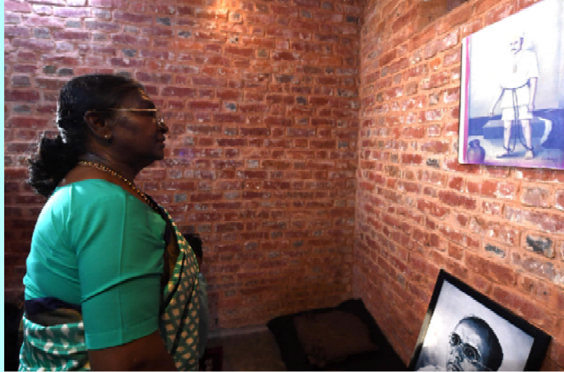
Hon'ble President, Smt. Droupadi Murmu visited the cell of the great freedom fighter Veer Savarkar at Cellular Jail on February 19. (More photos on last page)