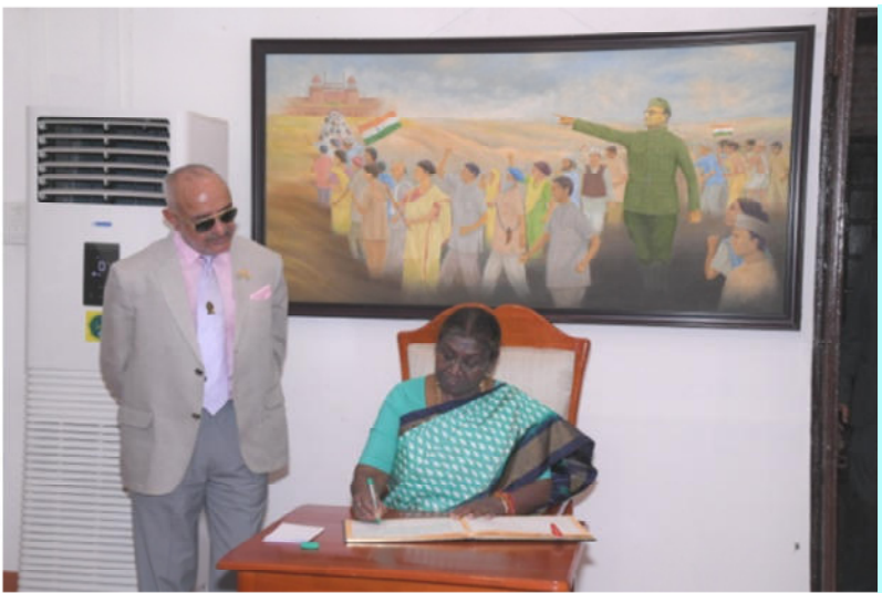
Hon'ble President, Smt. Droupadi Murmu penning her remarks in the Visitor's Book at National Memorial Cellular Jail on February 19.